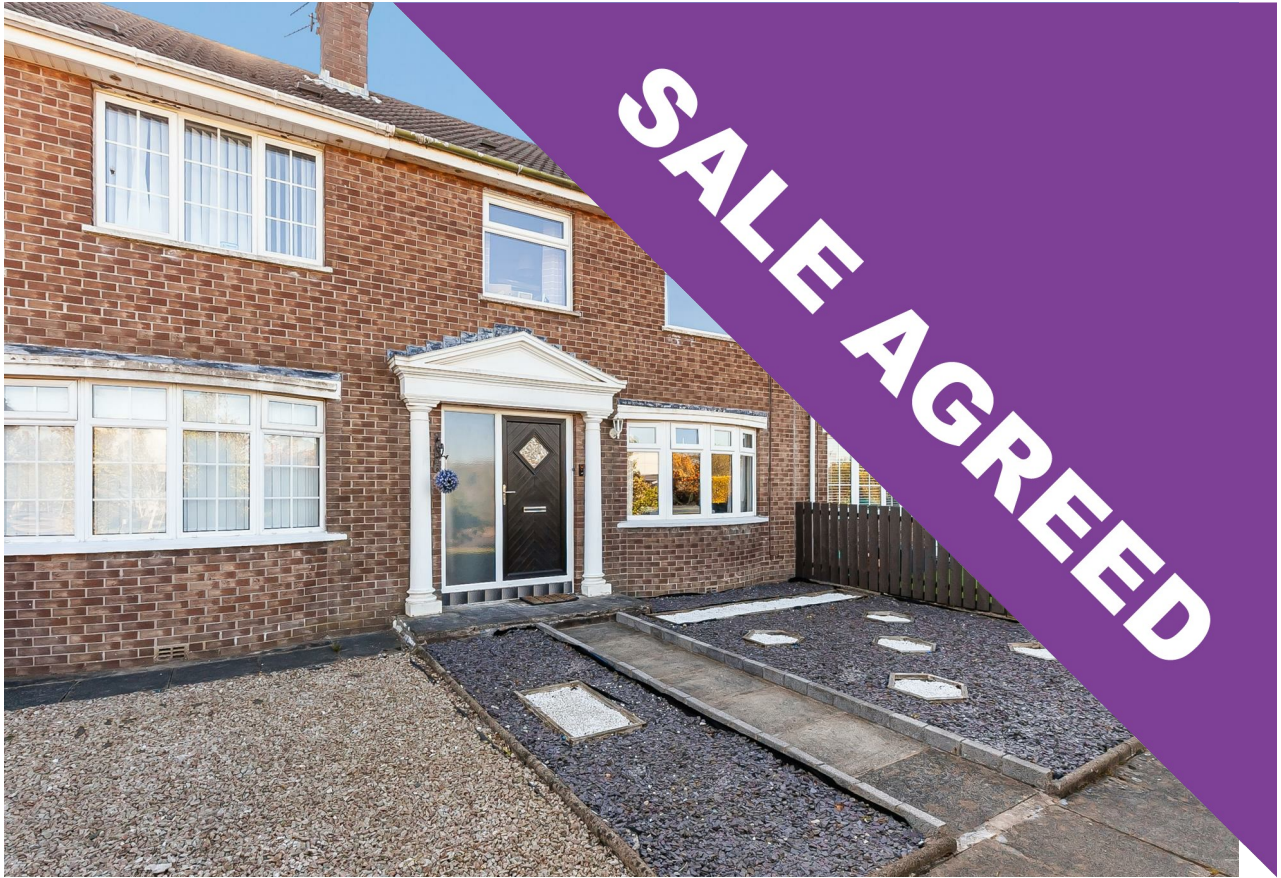
6 Cherrylands, Newtownabbey, BT36 6AU